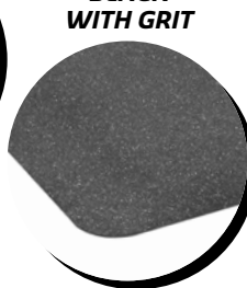
BLACK WITH GRIT