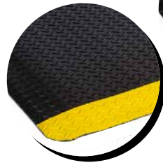
BLACK / YELLOW