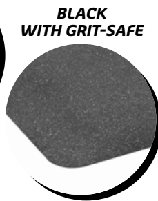
BLACK WITH GRIT-SAFE