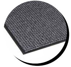
GREY / BLACK